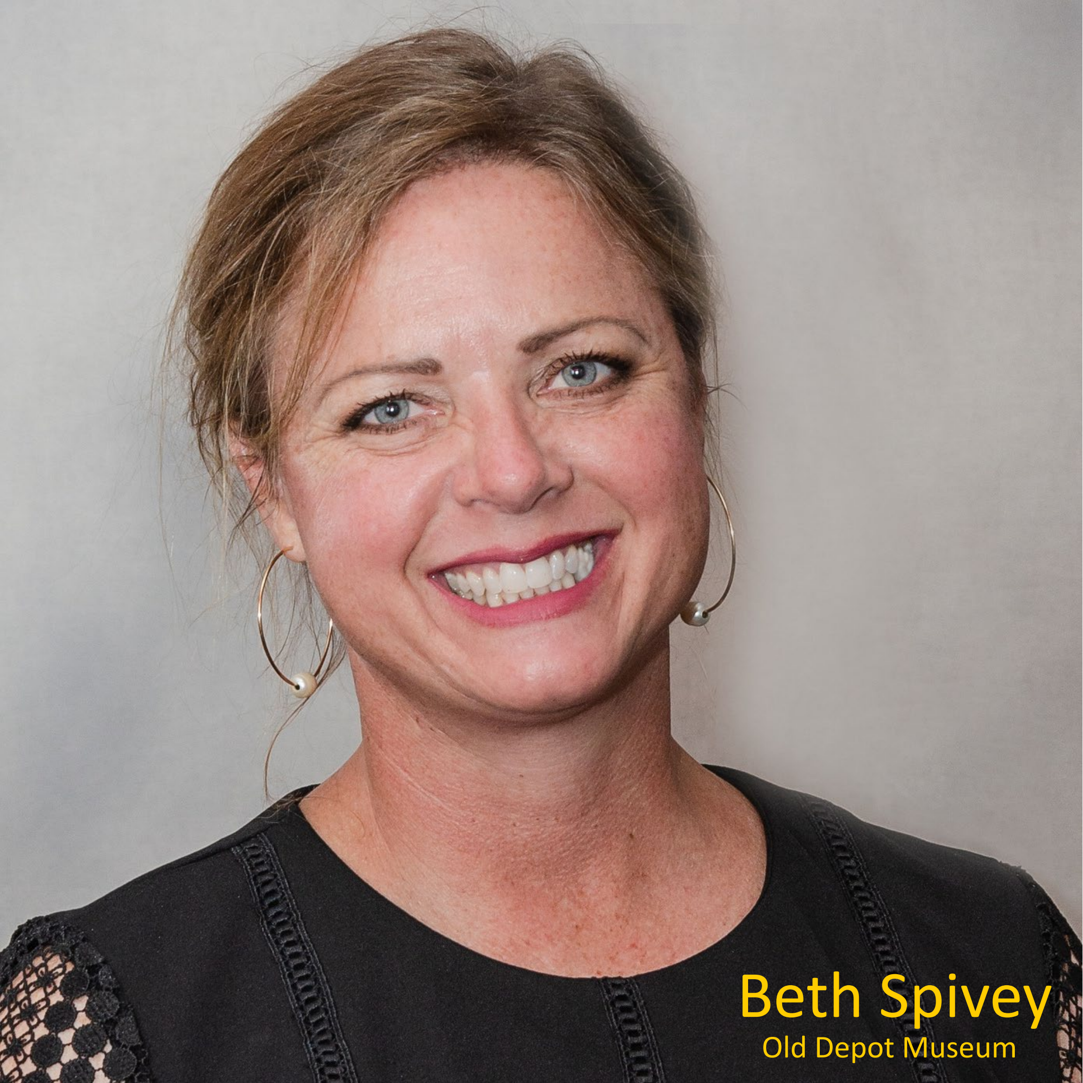
Beth Spivey Old Depot Museum